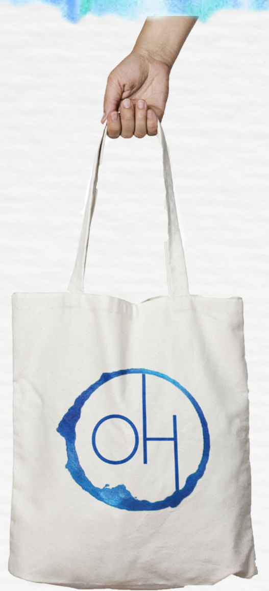
The Oh Bag Carry our cause anywhere